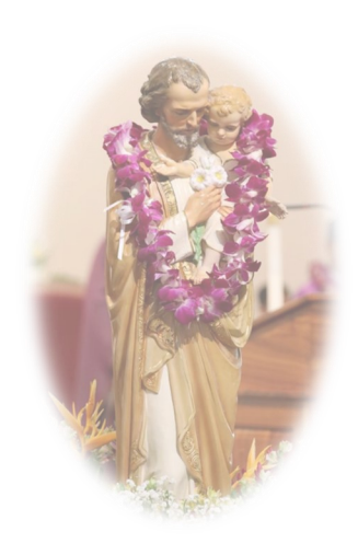
Please remember St. Joseph Parish in your will!

5 pm Saturday Vigil Mass 7 am, 9 am, 11:45 am and 6 pm Sunday